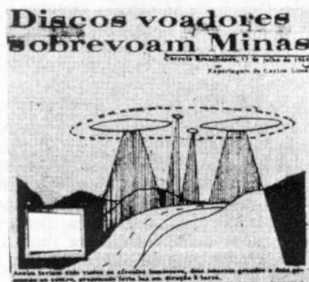
Sketch published in the newspaper Correio Braziliense of July 13, 1969, showing the UFOs seen at Coromandel, State of Minas Gerais, in September 1968 (Case No. 36.)

made towards the station-wagon at terrifying speed. Ubaldo (who lives at Taguatinga QNA-7, Lot No. 23) put his foot on the accelerator and fled precipitately downhill. The members of the family all thought the object was going to strike the car and therefore all ducked as the UFO passed overhead.