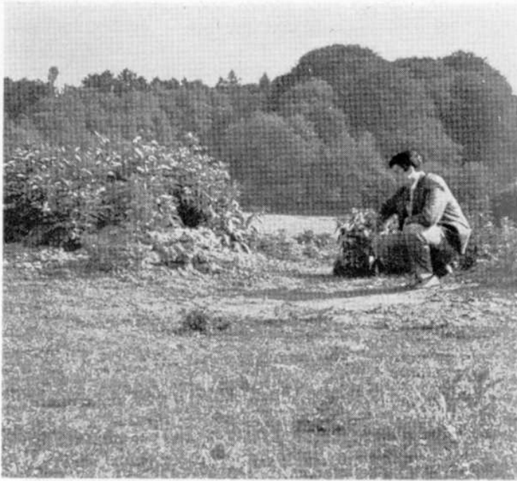
The author at the landing place

first saw the glow. He added that there was no sign of life or other activity in the vicinity of the craft and there was no noise at any time.